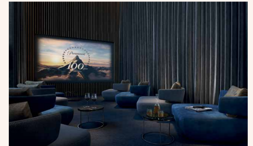
Residents' cinema — Artist's impression