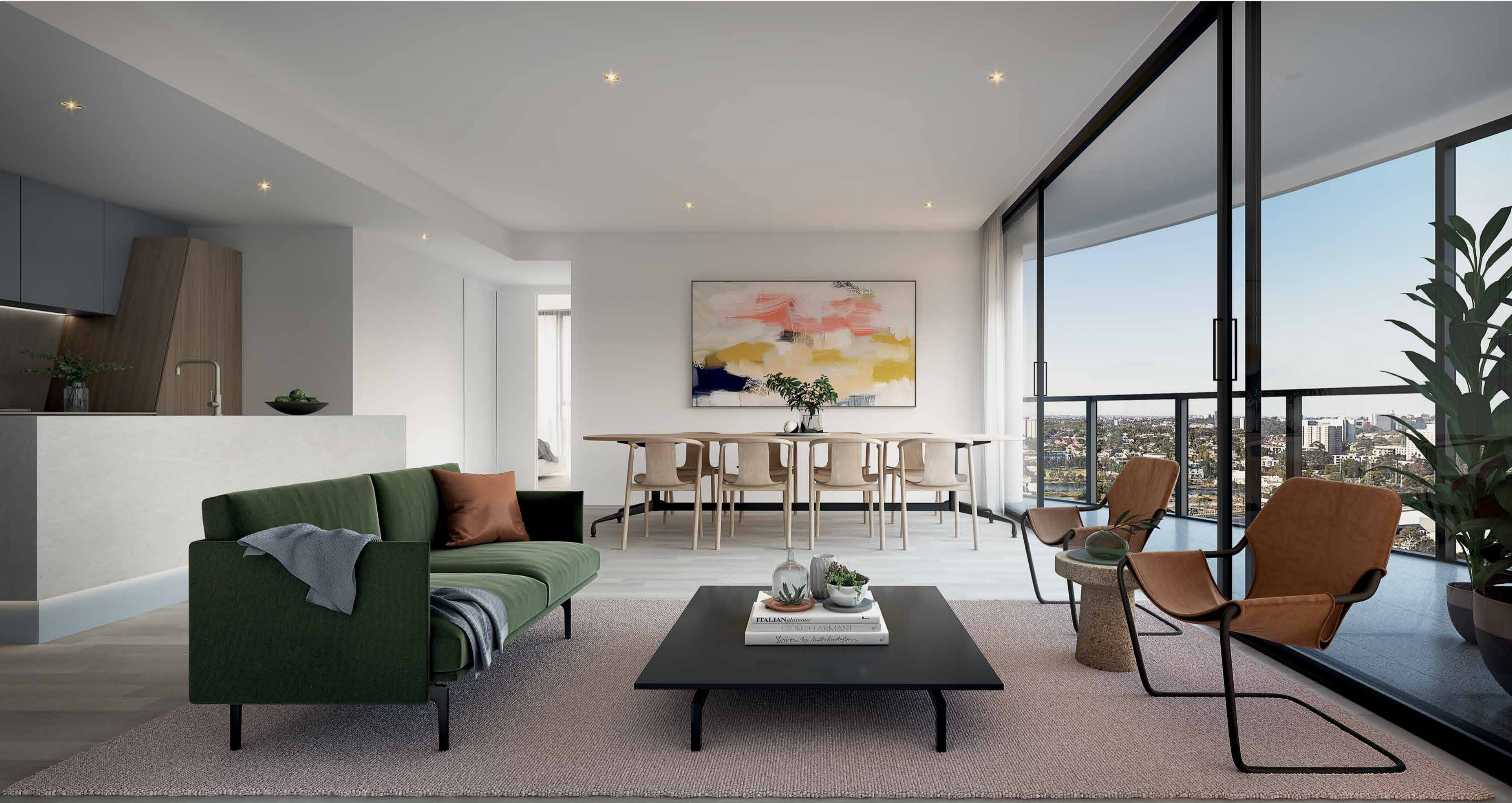
Living room – Artist's impression