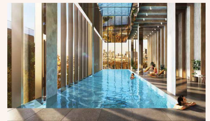
Residents' swimming pool — Artist's impression