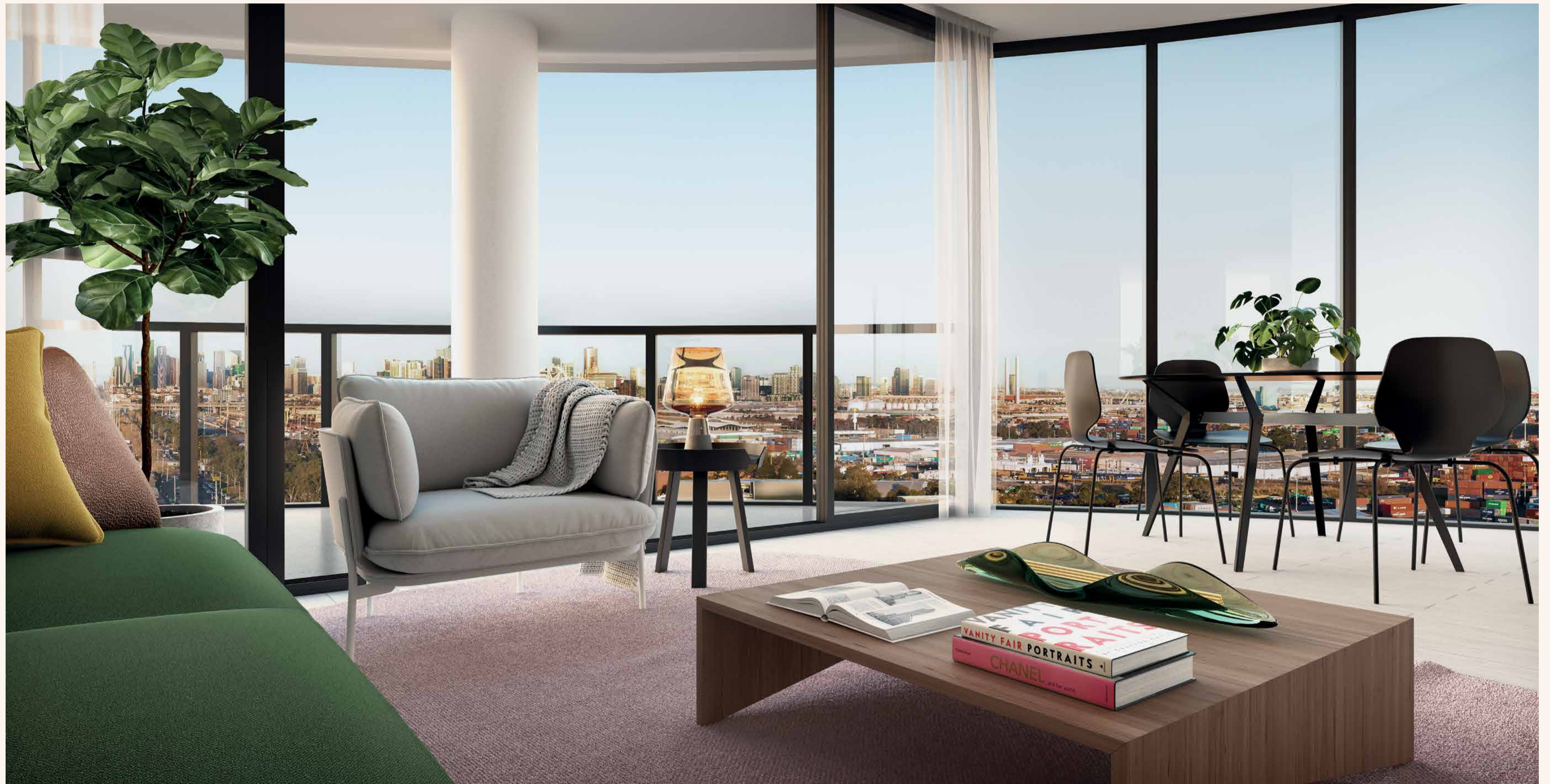
Living room – Artist's impression