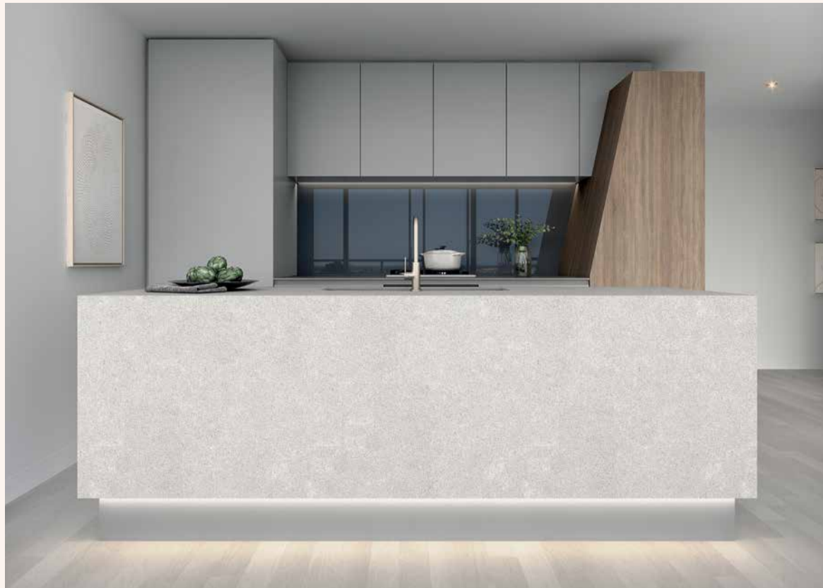
Kitchen, light scheme — Artist's impression