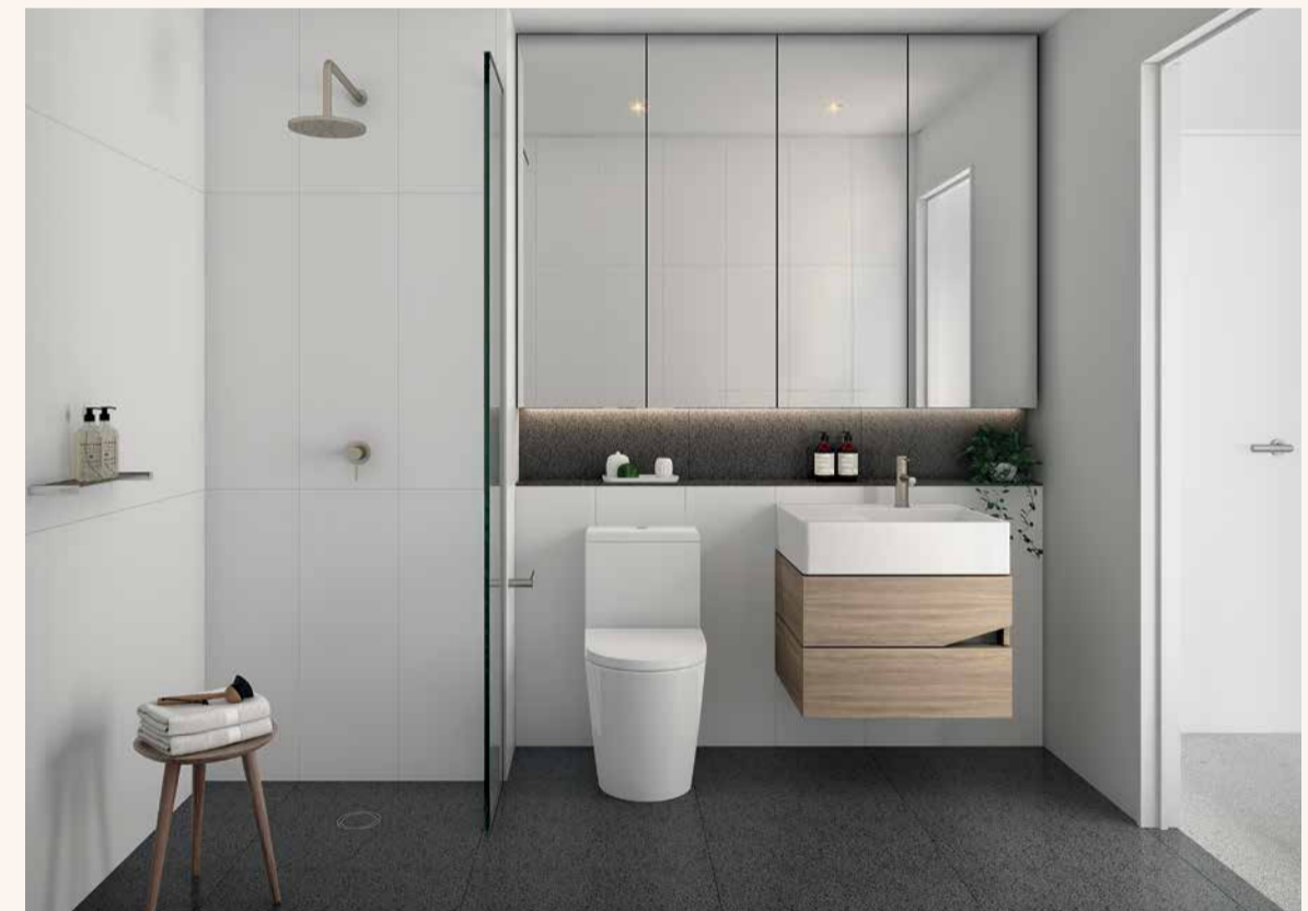
Bathroom, dark scheme — Artist's impression