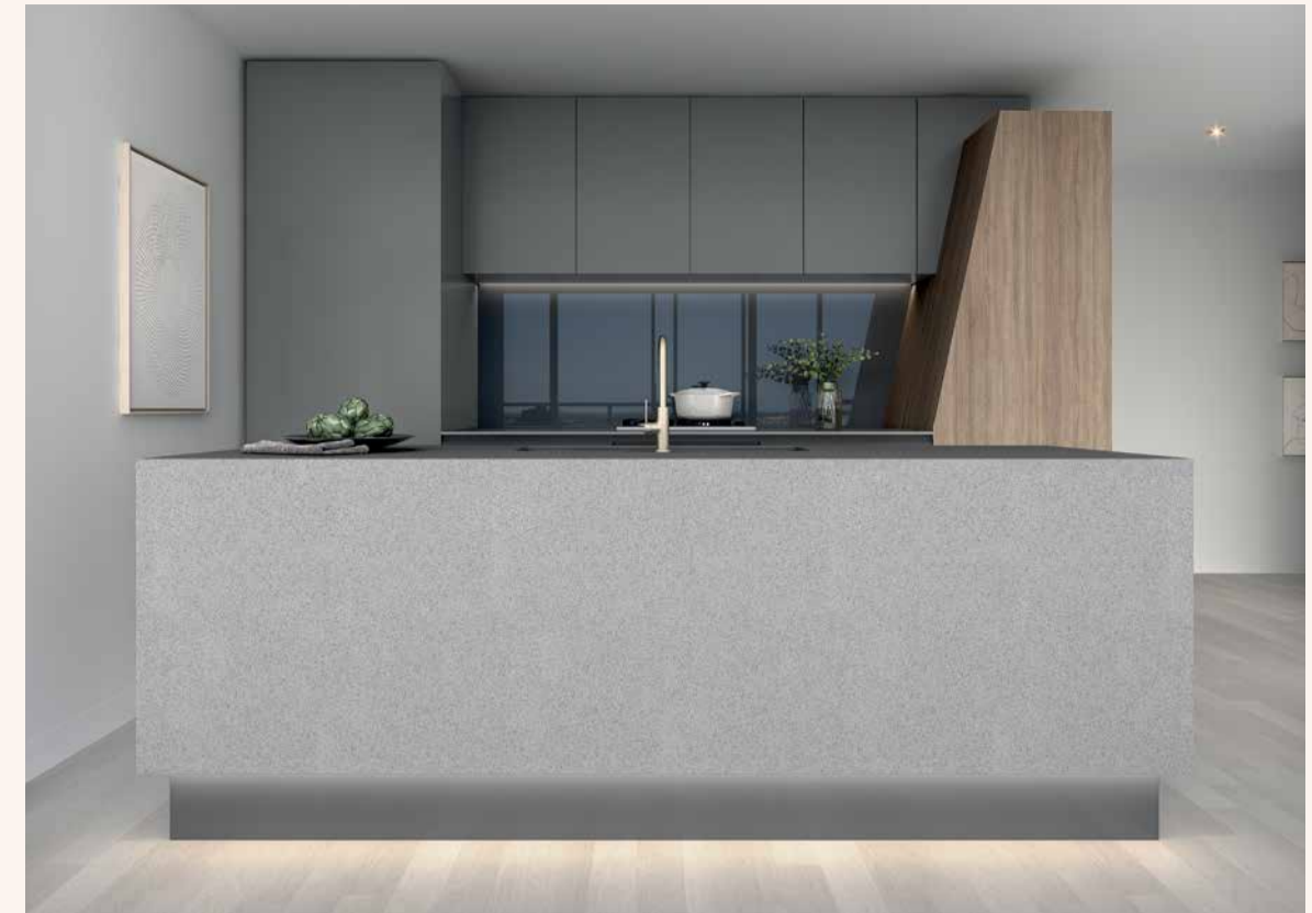
Kitchen, dark scheme — Artist's impression