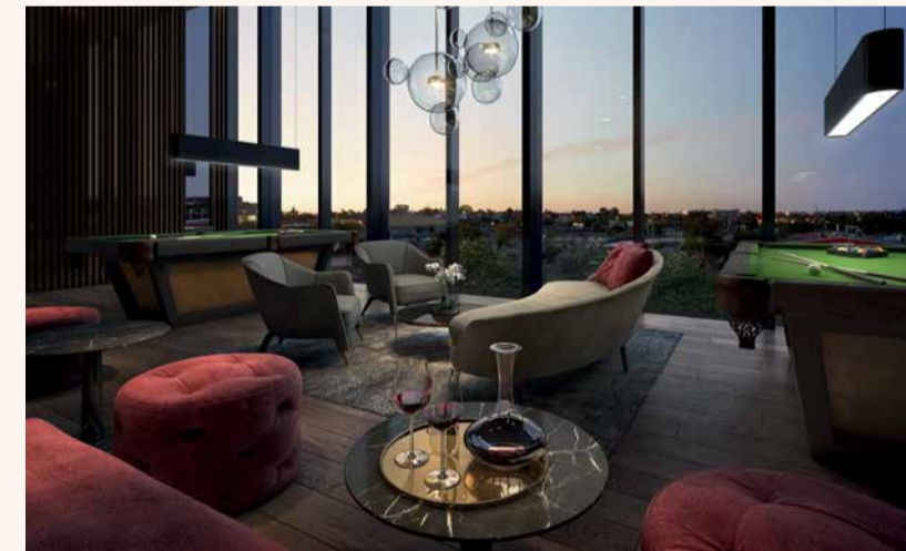
Residents' game's room — Artist's impression

For special entertainment, a private dining room with a fully-equipped commercial kitchen and bar offers an ideal space to host get-togethers and dinner parties, all with spectacular tableaux over the city.