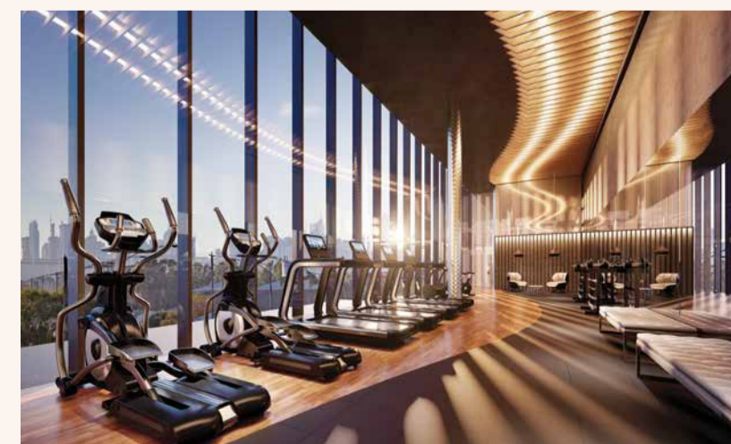
Residents' gymnasium — Artist's impression