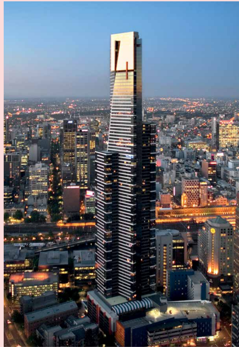
Eureka Tower designed by Fender Katsalidis

This exciting collaboration between two innovative companies is destined to raise the benchmark of architectural and development practice. Both Fender Katsalidis and Growland are committed to visionary, future-oriented projects, forged through strong collaborations. Fender Katsalidis' multi-award winning international design practice creates a new standard for creativity and sustainability across the world; Growland's strong background in joining with industry experts and delivering world-class developments makes this the perfect partnership.