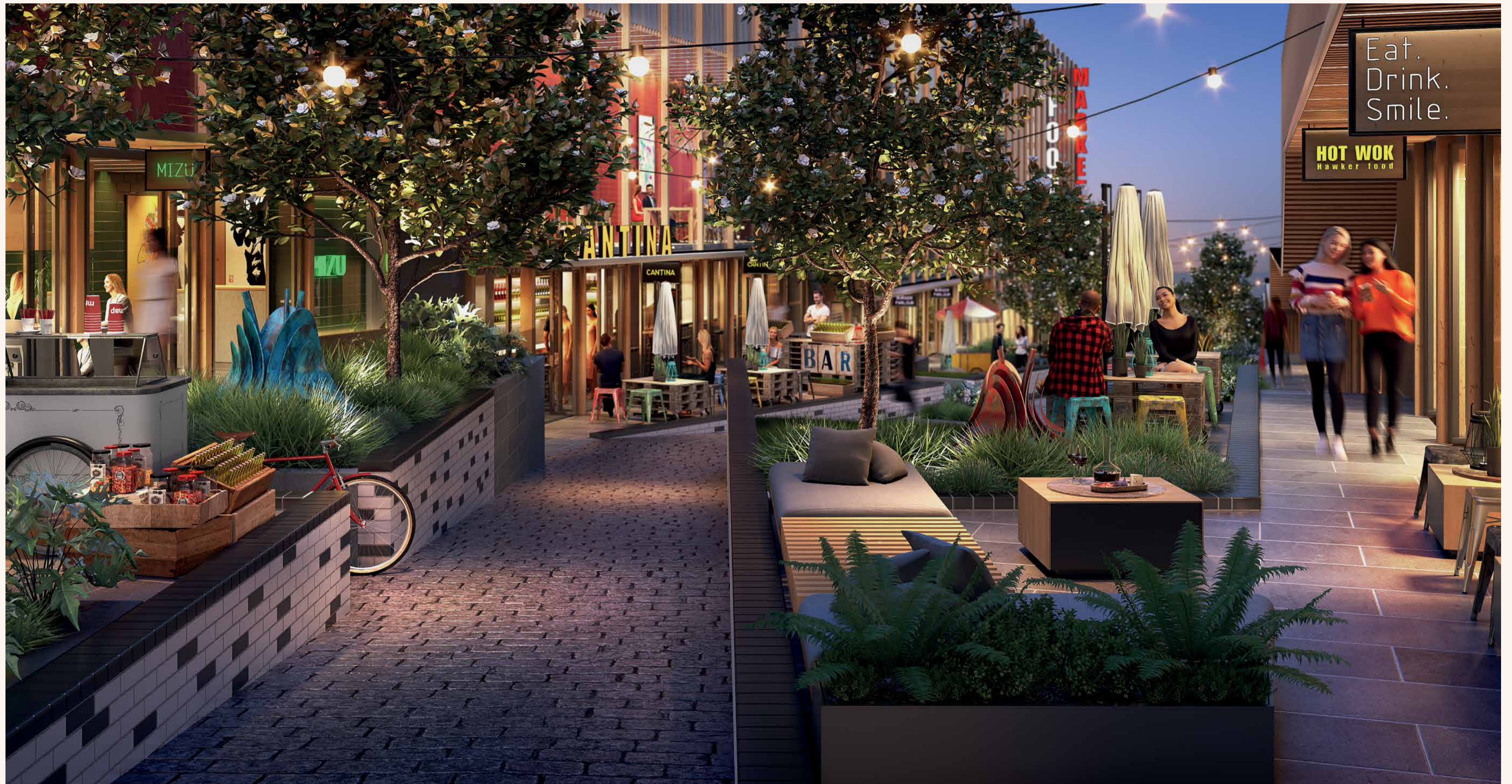
Victoria Square's laneway — Artist's impression