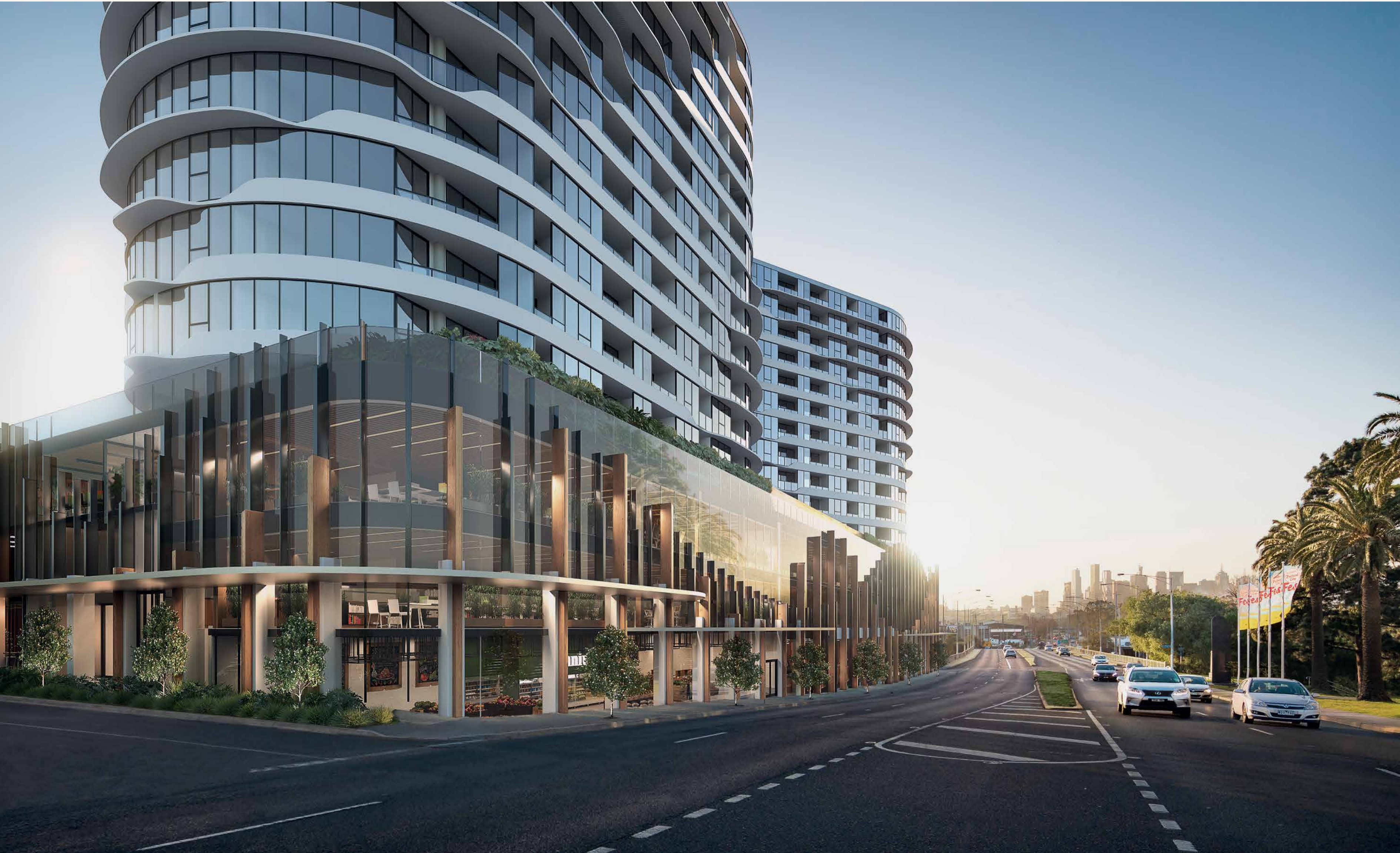
Victoria Square's podium — Artist's impression