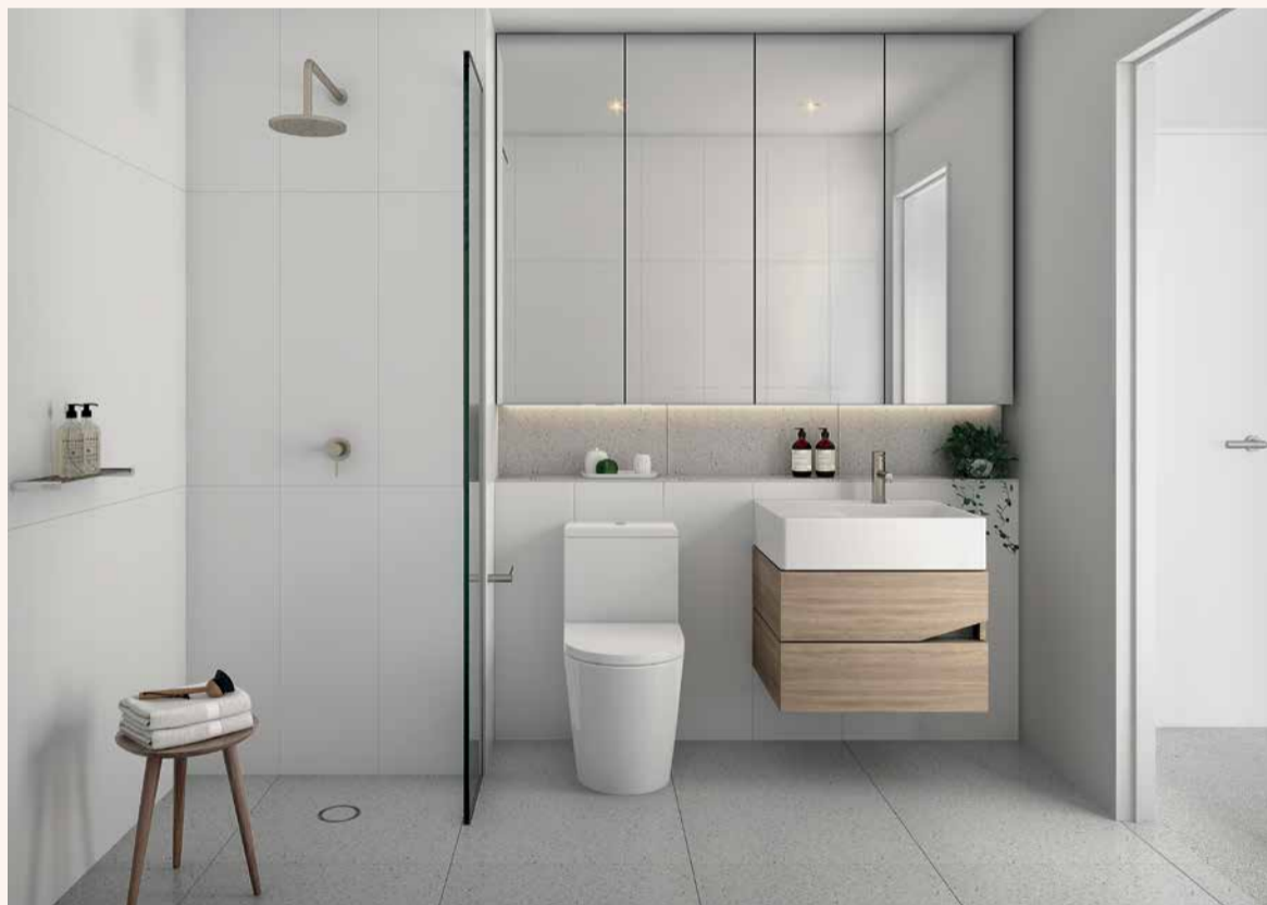
Bathroom, light scheme — Artist's impression