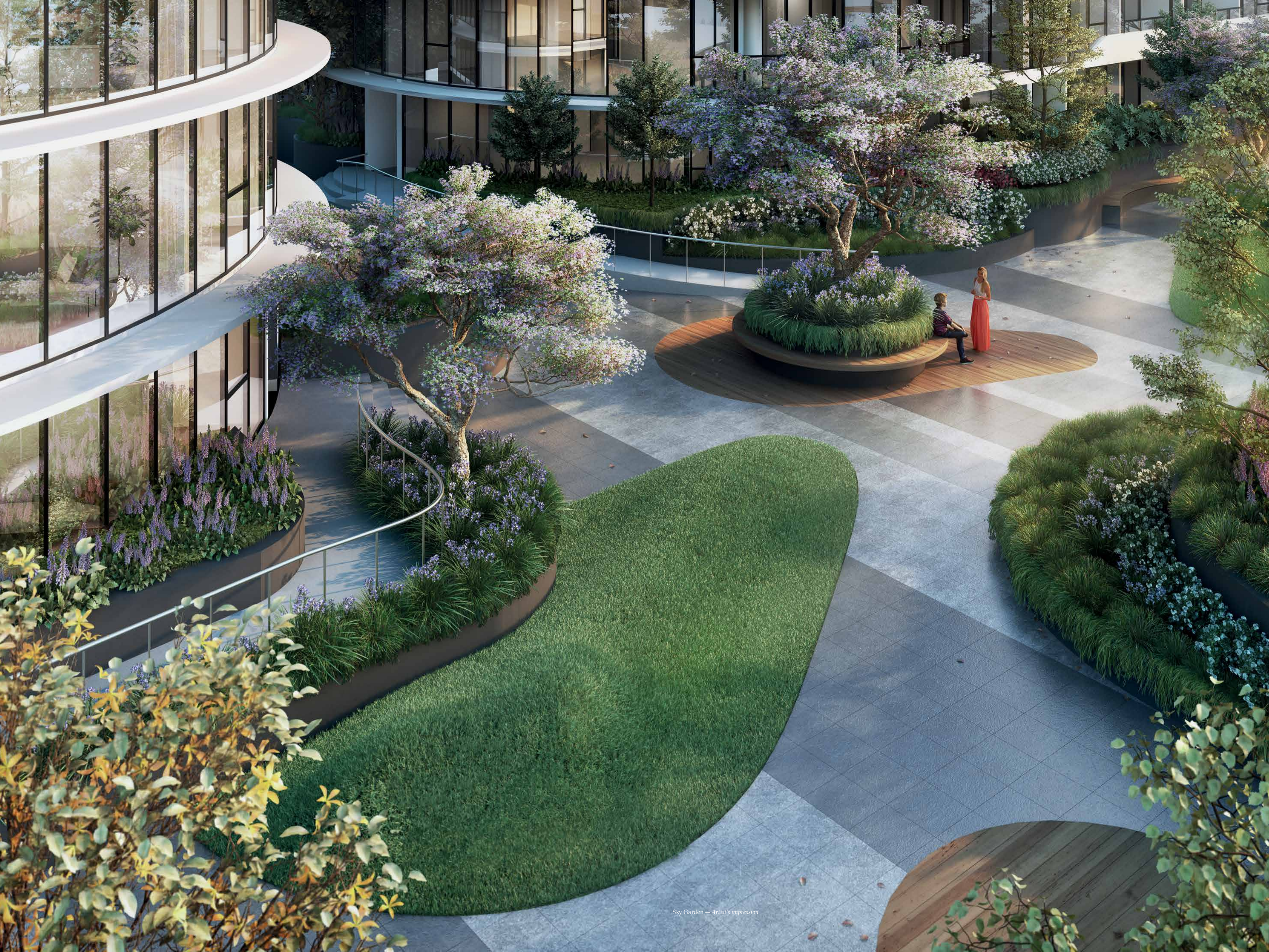
Sky Garden — Artist's impression