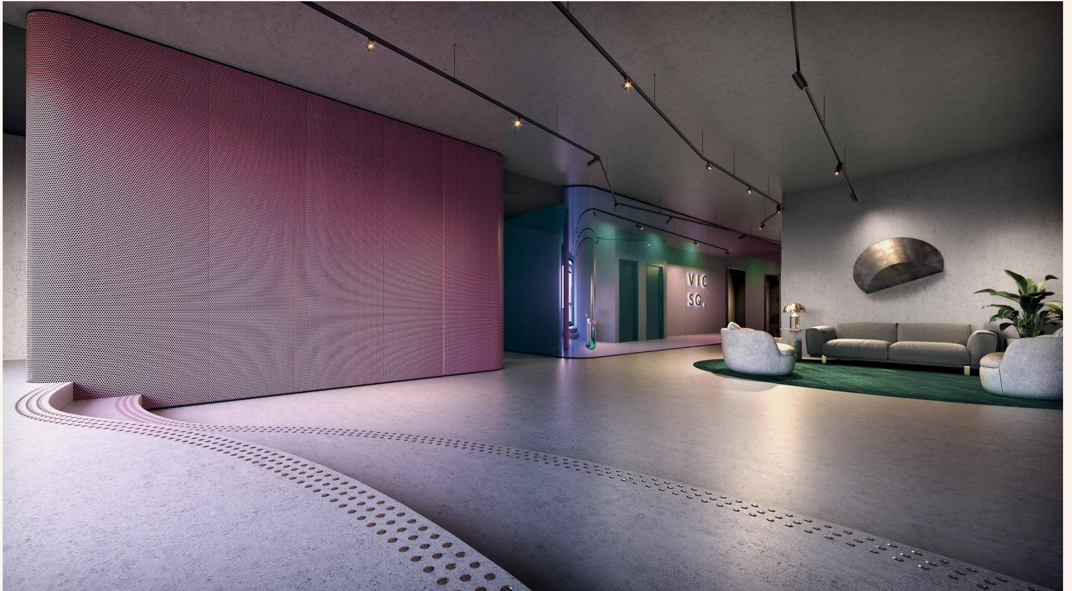
VS.03 Lobby – Artist's impression