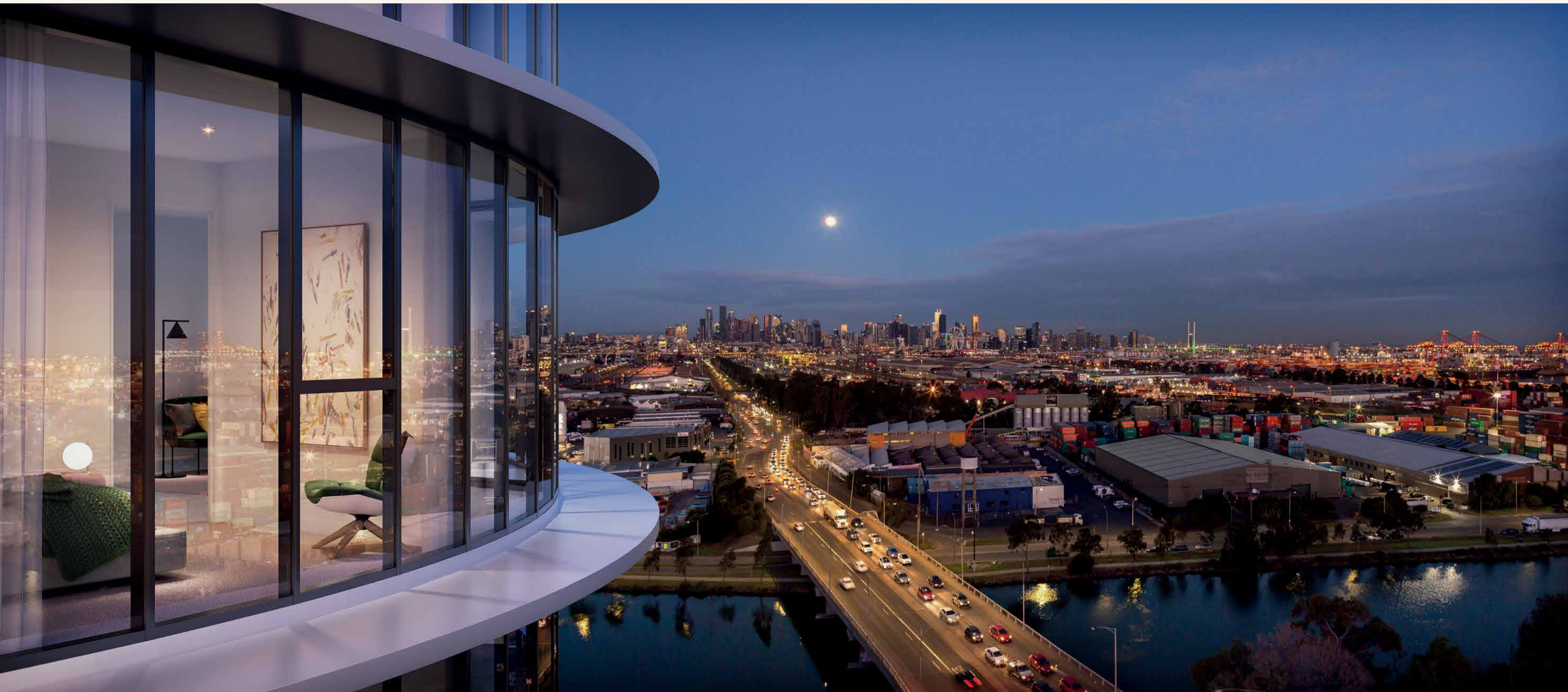
City views — Artist's impression