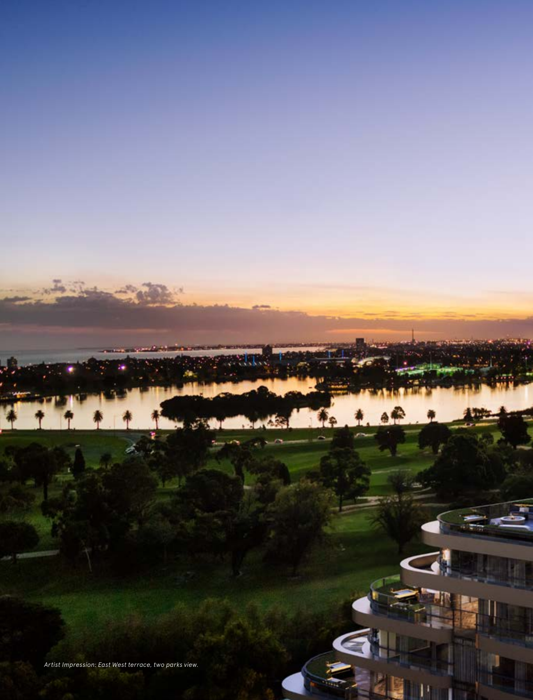
Artist Impression: East West terrace, two parks view.