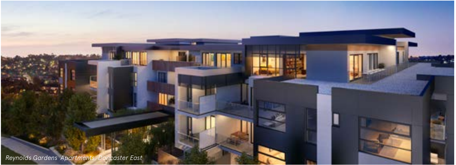
Reynolds Gardens Apartments, Doncaster East