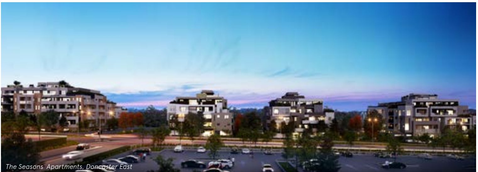
The Seasons Apartments, Doncaster East

JD Group aims to deliver high quality, sustainable developments, with good design and diligent management. From site acquisition to completion, JD Group works with the most reputable teams of architects, engineers and builders throughout the development process. Projects developed by JD Group consistently provide excellent return, offering homeowners and investors a secure financial investment today and the future.