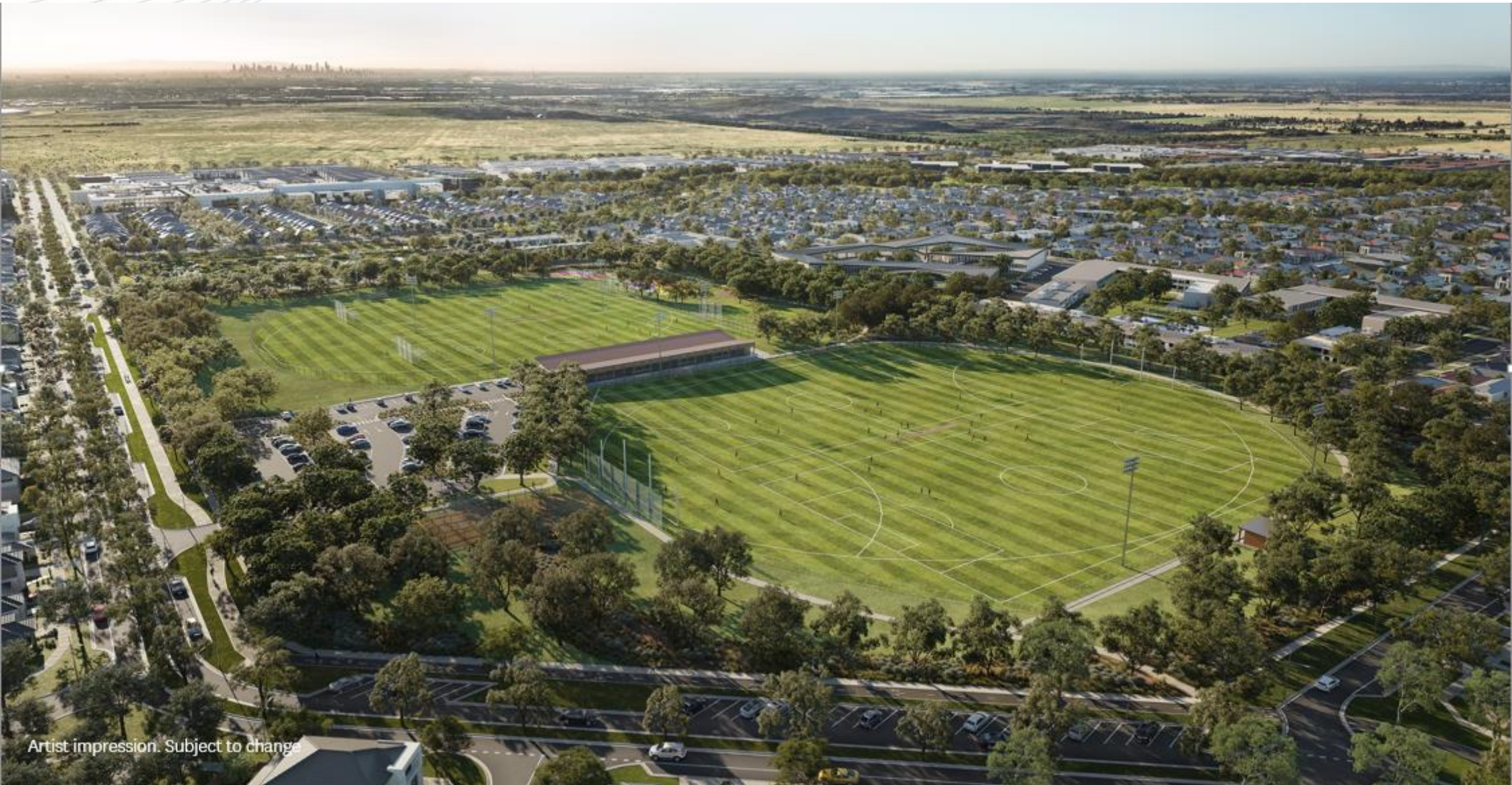
Artist impression. Subject to change

Masterplan supplied for the purpose of providing an impression of Stockland Grandview and the approximate location of existing and proposed third party infrastructure, facilities, amenities, services and destinations, and is not intended to be used for any other purpose. Indications of location, distance or size are approximate and for indicative purposes only. Subject to change. Not to scale. All distance and travel timeframe references are estimates only, refer to distance by car or driving time (unless specified otherwise), and are based on information obtained from Google Maps at the time of publication (August 2021).