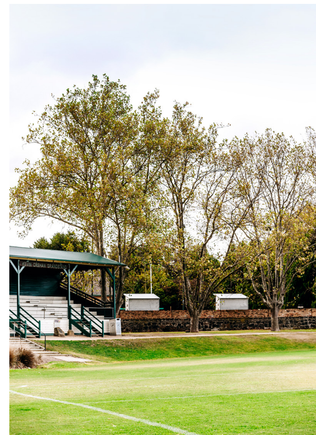
LEFT — Studley Park, ABOVE — Alphington Park