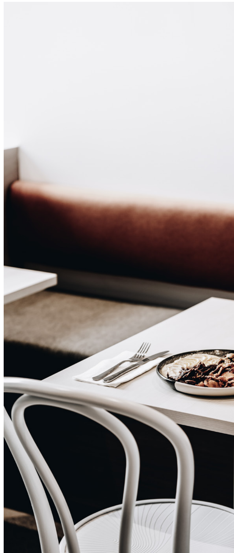
LEFT — Shawarma plate and chips.

Oasis Bakery opened 20 years ago as a humble little Lebanese cake shop in Murrumbena. Since then, it has grown leaps and bounds, expanding into a Middle Eastern café, restaurant, grocery store, deli and cooking school, all run by the dedicated Makool Family. A sure-fire Melbourne institution, its cult following grew so much, the family decided to open a second Oasis in the inner-north.