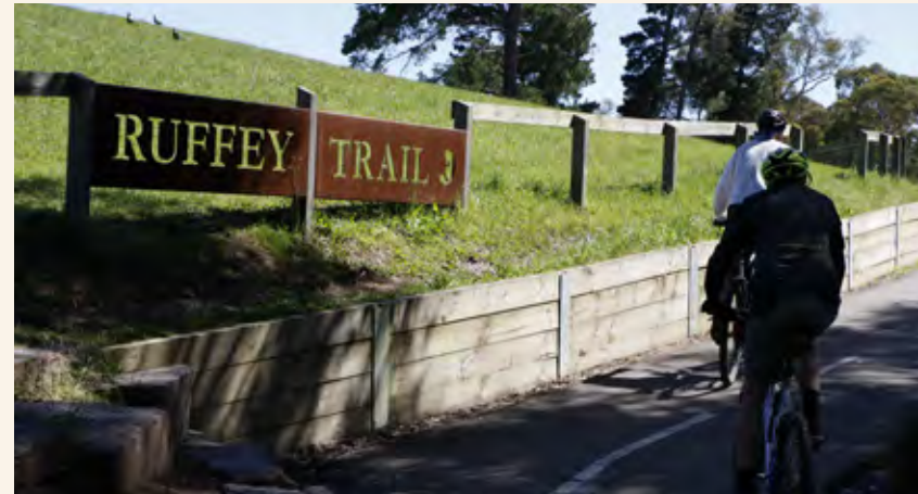
Ruffey Trail 15 Nambour Rd, Templestowe

There are countless reasons to make 5 Henry Street your home. Take five of our favourites that encapsulate the delight of living among the hills close to the heart of Doncaster.