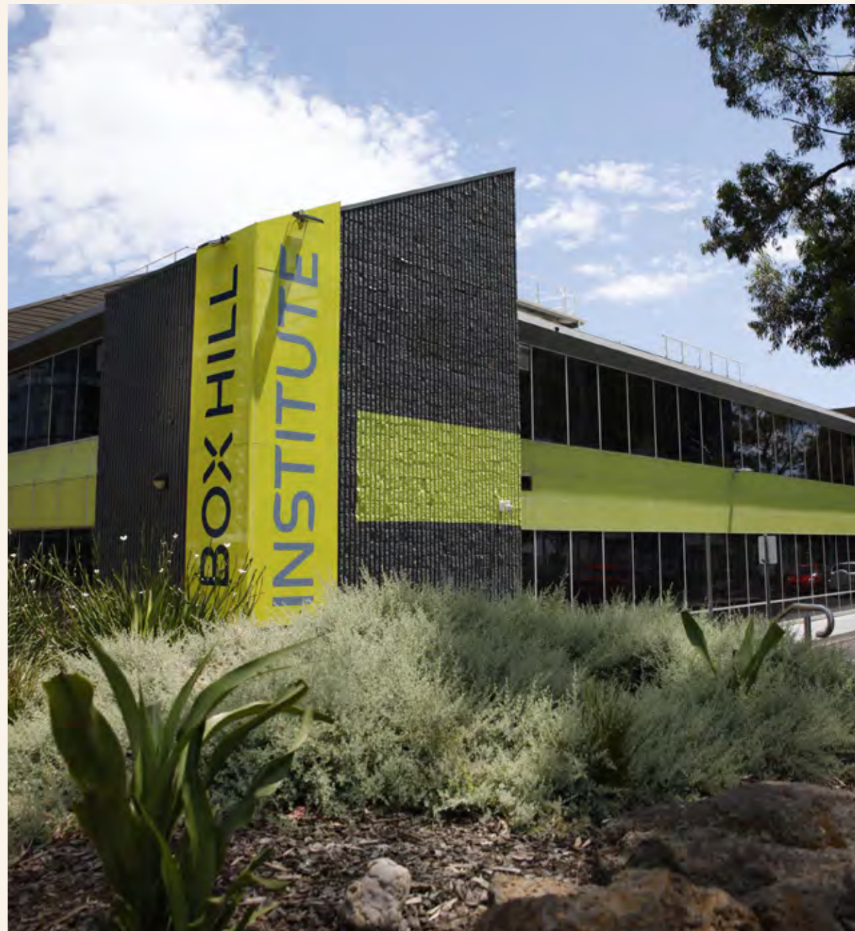
Box Hill Institute 465 Elgar Rd, Box Hill