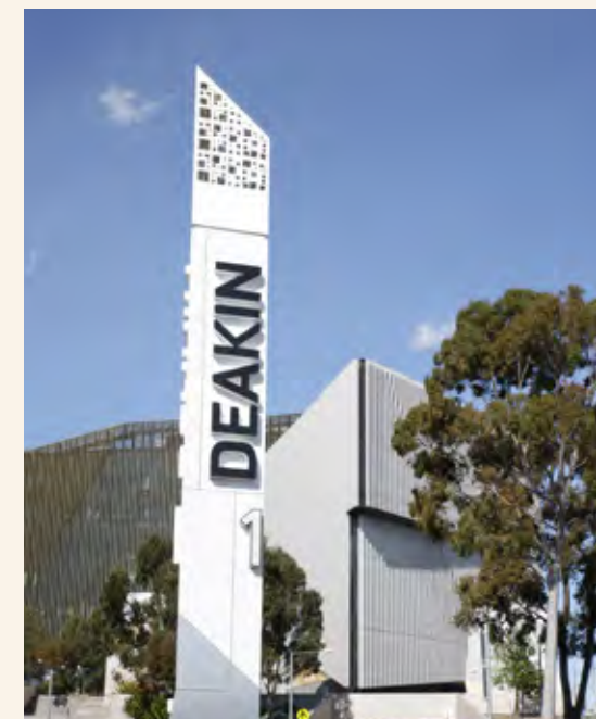
Deakin University 221 Burwood Hwy, Burwood