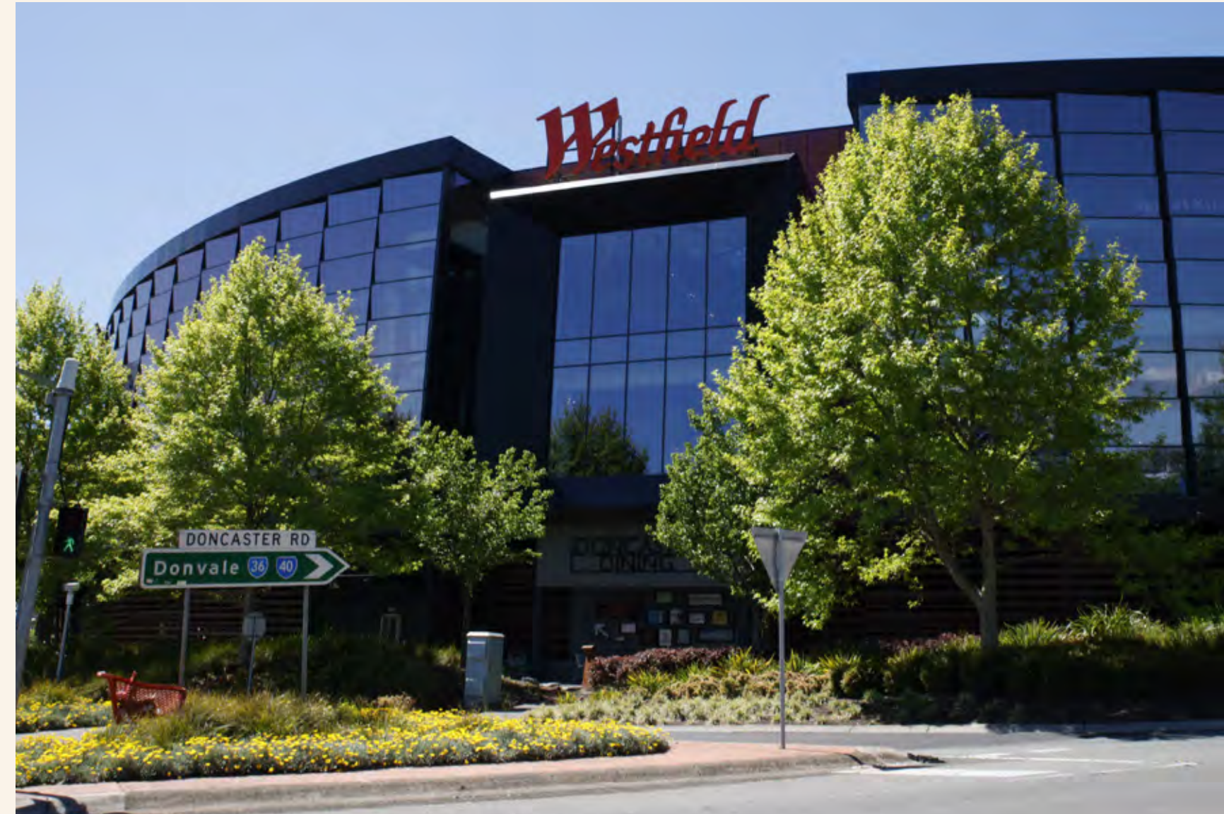
Westfield Doncaster Shopping Center 619 Doncaster Rd, Doncaster