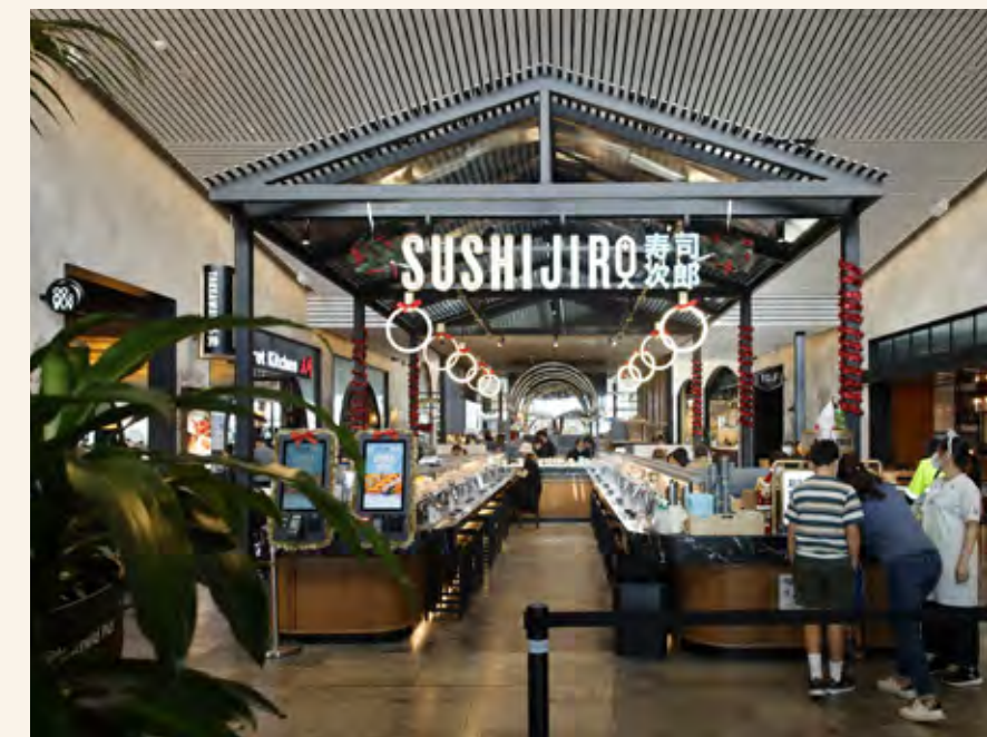
Westfield Doncaster Shopping Centre 619 Doncaster Rd, Doncaster