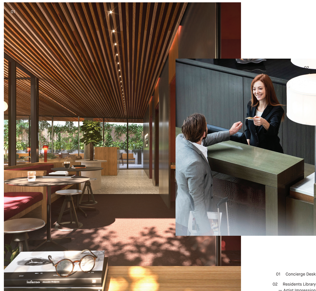
01 Concierge Desk 02 Residents Library — Artist Impression

At Verde, mornings unfold effortlessly with every amenity within arm's reach catering to all desires. Begin your day with a freshly brewed coffee from the downstairs café. For those working or studying from home, transition seamlessly into your day-to-day within the co-working space, an elegant space designed to inspire creativity and foster productivity. Concierge staff on the ground floor await your instruction; they are available to assist