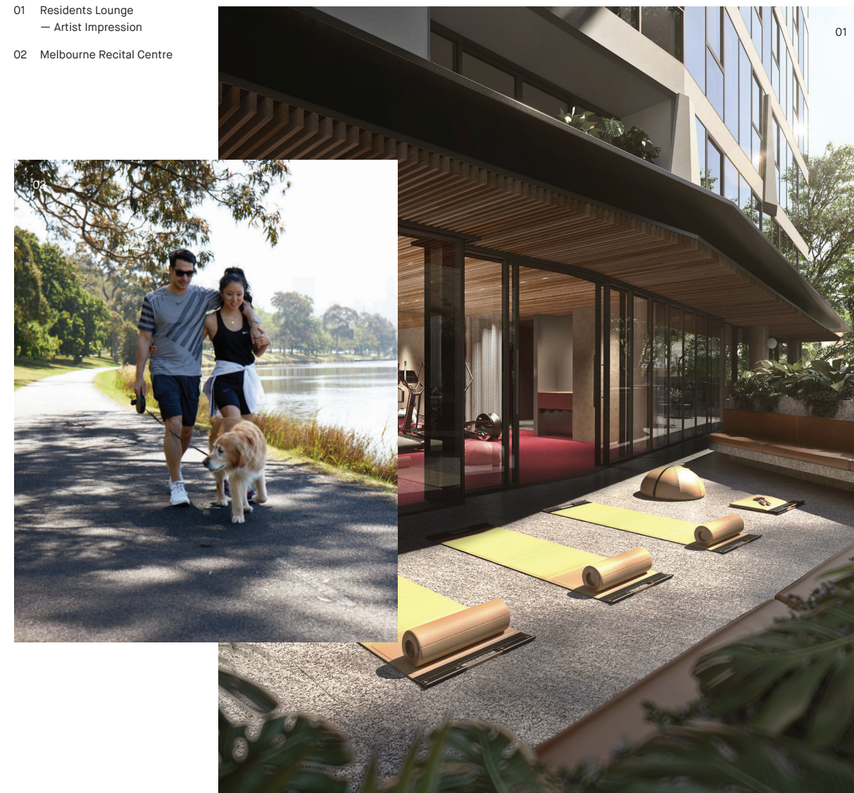
01 Residents Lounge — Artist Impression 02 Melbourne Recital Centre

The afternoon is a time to decompress then rejuvenate. Immerse in Melbourne's best attractions and connect to nature with a peaceful stroll. Just moments away you'll find Albert Park Lake, The Tan, Royal Botanical Gardens and Port Melbourne. Walk along tree-lined paths and the Yarra River and lose yourself in the tranquility offered by these verdant grounds.