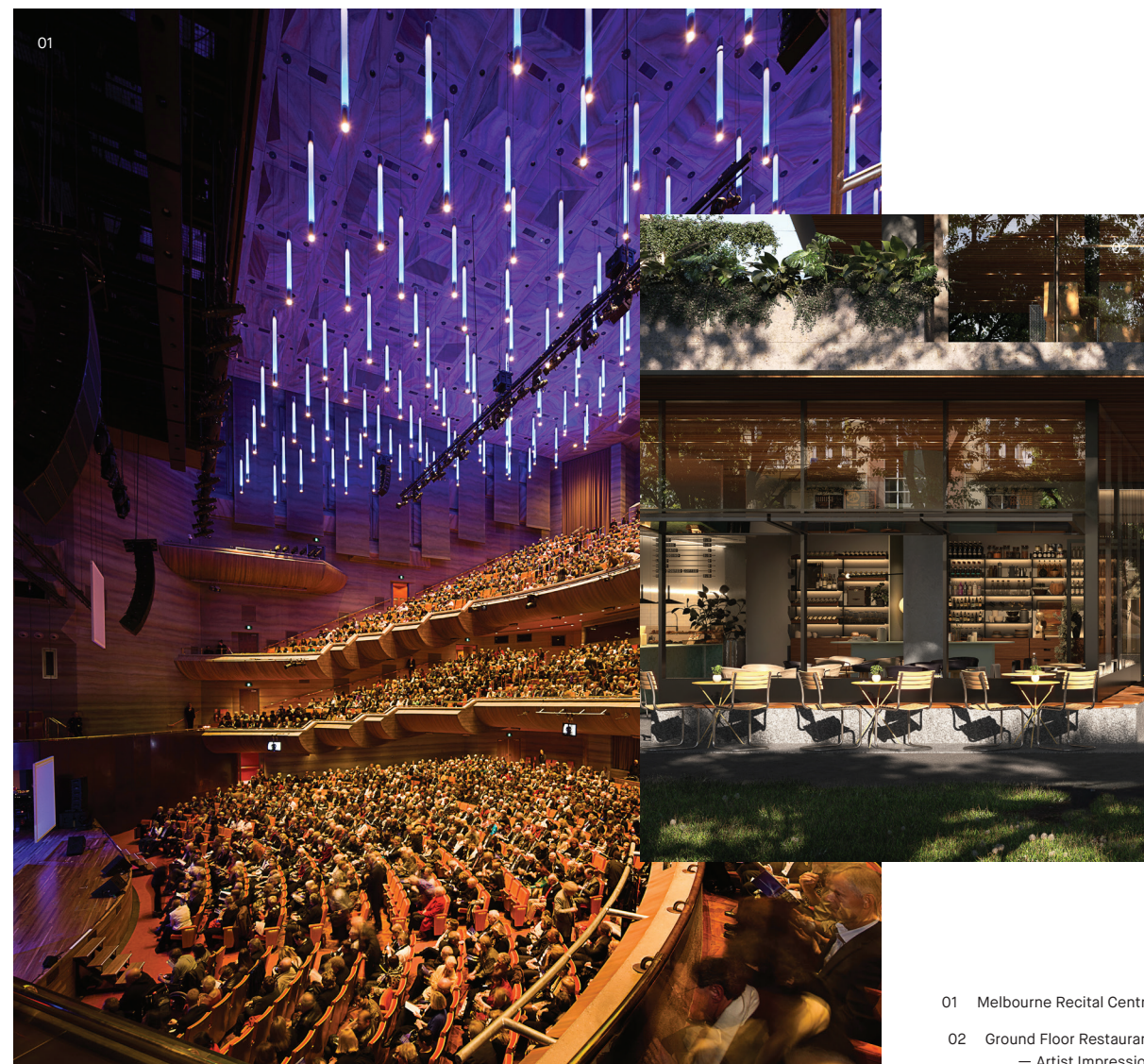
01 Melbourne Recital Centre 02 Ground Floor Restaurant — Artist Impression

If you're wanting to enjoy a quiet night-in, Verdes elegant residents lounge has been designed as an extension of your home. With a gas fireplace, an eight-seater table and lounge, you can host an intimate dinner party or simply meet, relax and unwind with friends and family. During warmer nights, step out onto the private terrace garden with barbecue facilities and luxury furnishings where you can enjoy an outdoor dinner in your own tranquil retreat. If you don't feel like cooking, there's no need to venture far. Simply head