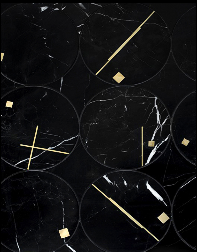
SECOND BATHROOM INDIGO MARBLE HONED STONE BENCHTOPS