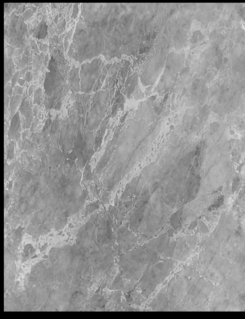
Bathroom Carrara Mosaic Marble Honed Stone Waterjet Floor Pattern