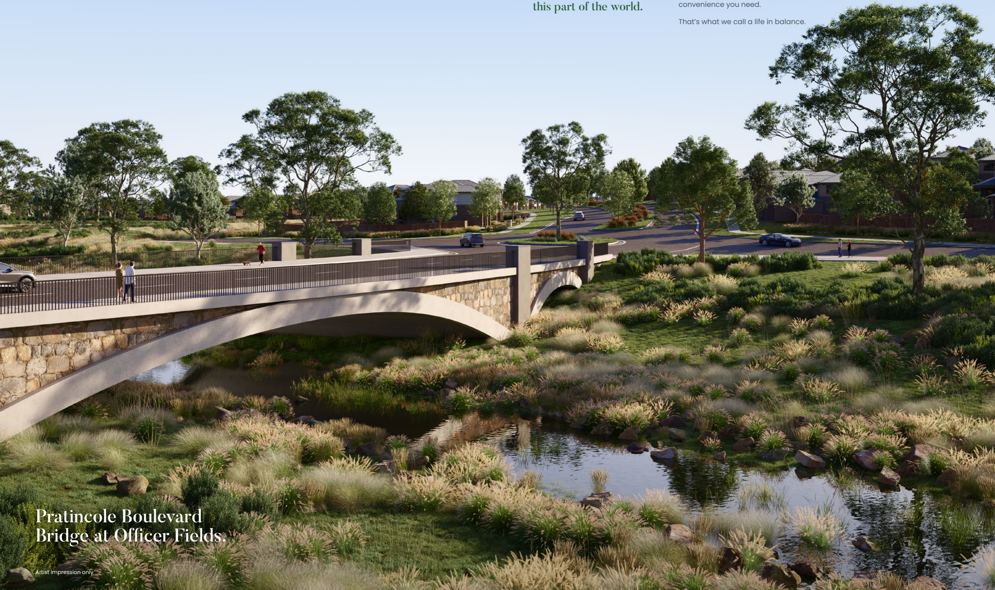
Pratincole Boulevard Bridge at Officer Fields.