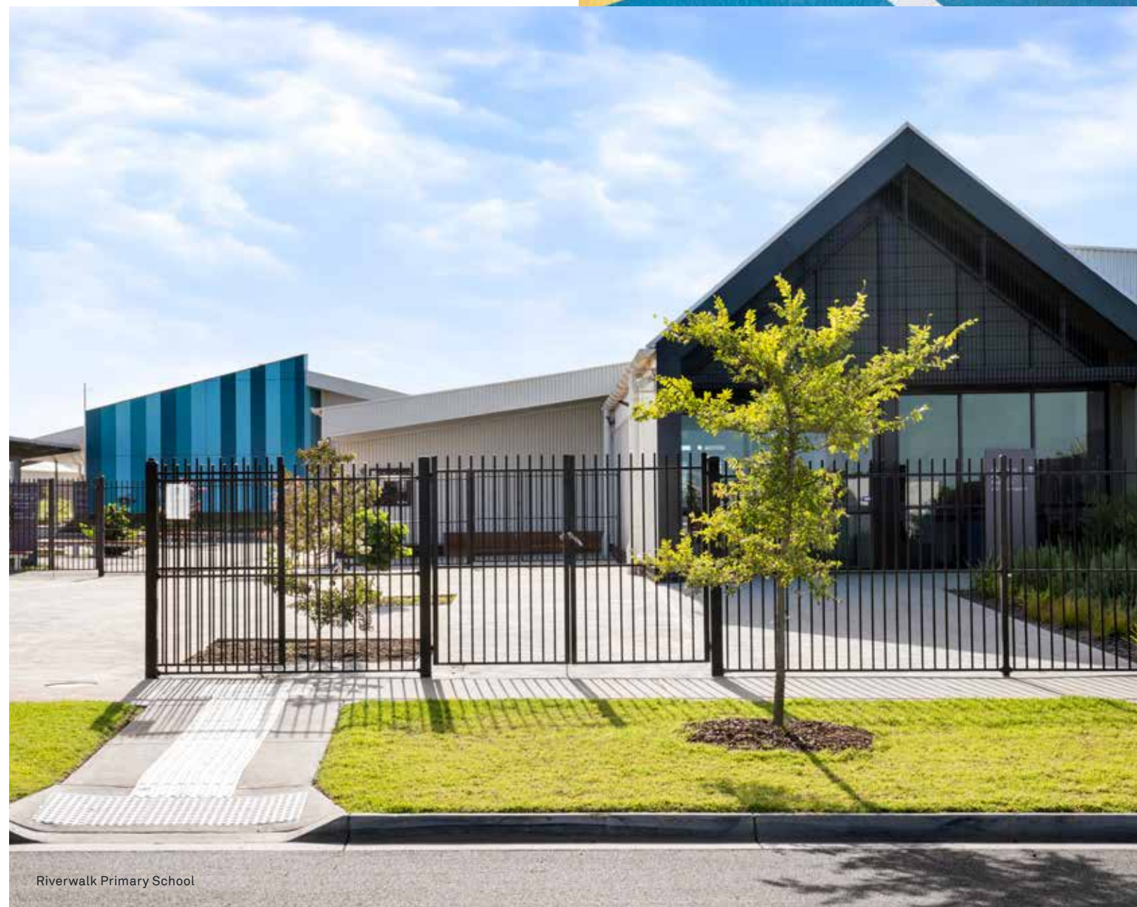
Riverwalk Primary School