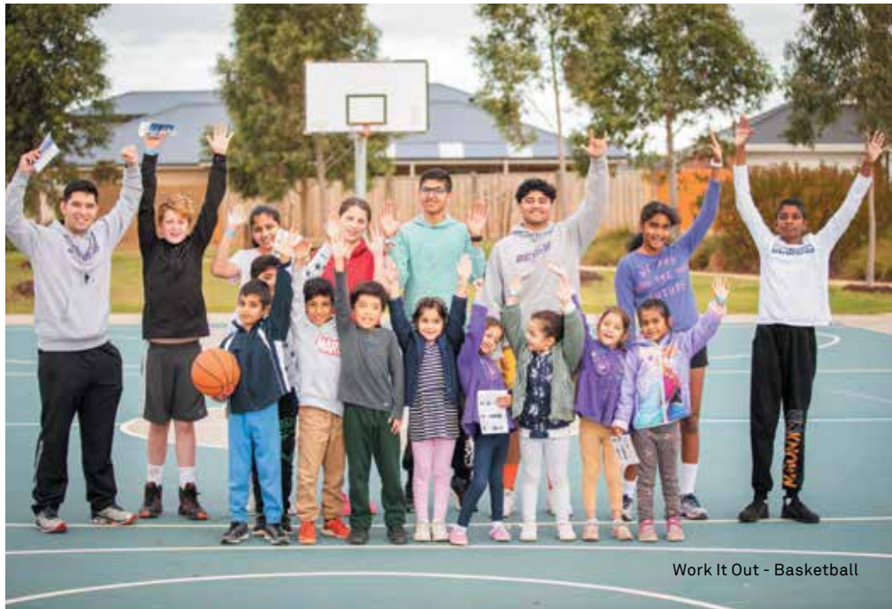
Work It Out - Basketball