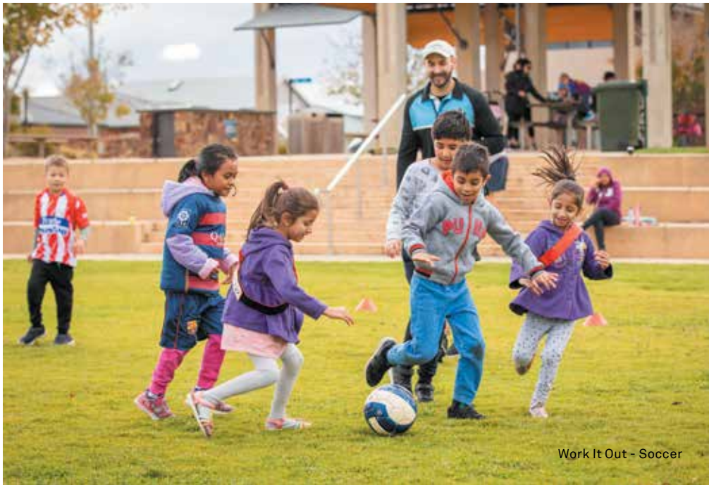
Work It Out - Soccer