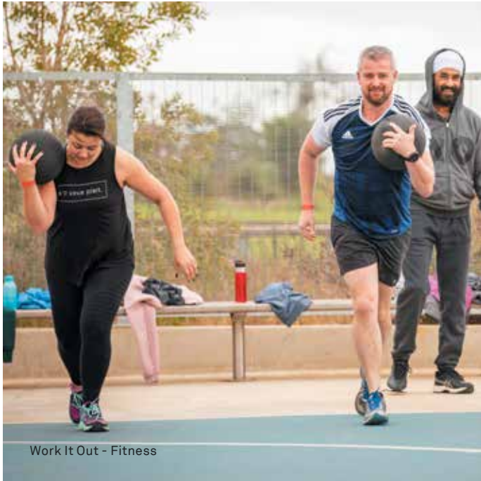
Work It Out - Fitness