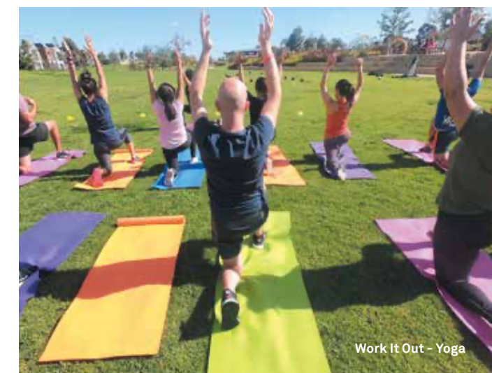
Work It Out - Yoga

A range of activities, initiated by Development Victoria, will delight all ages and build new friendships.