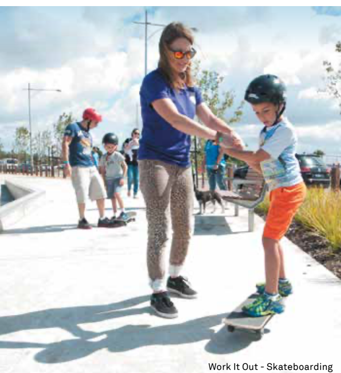
Work It Out - Skateboarding

Join a friendly engaged community with its own program of events for bringing residents and families together.