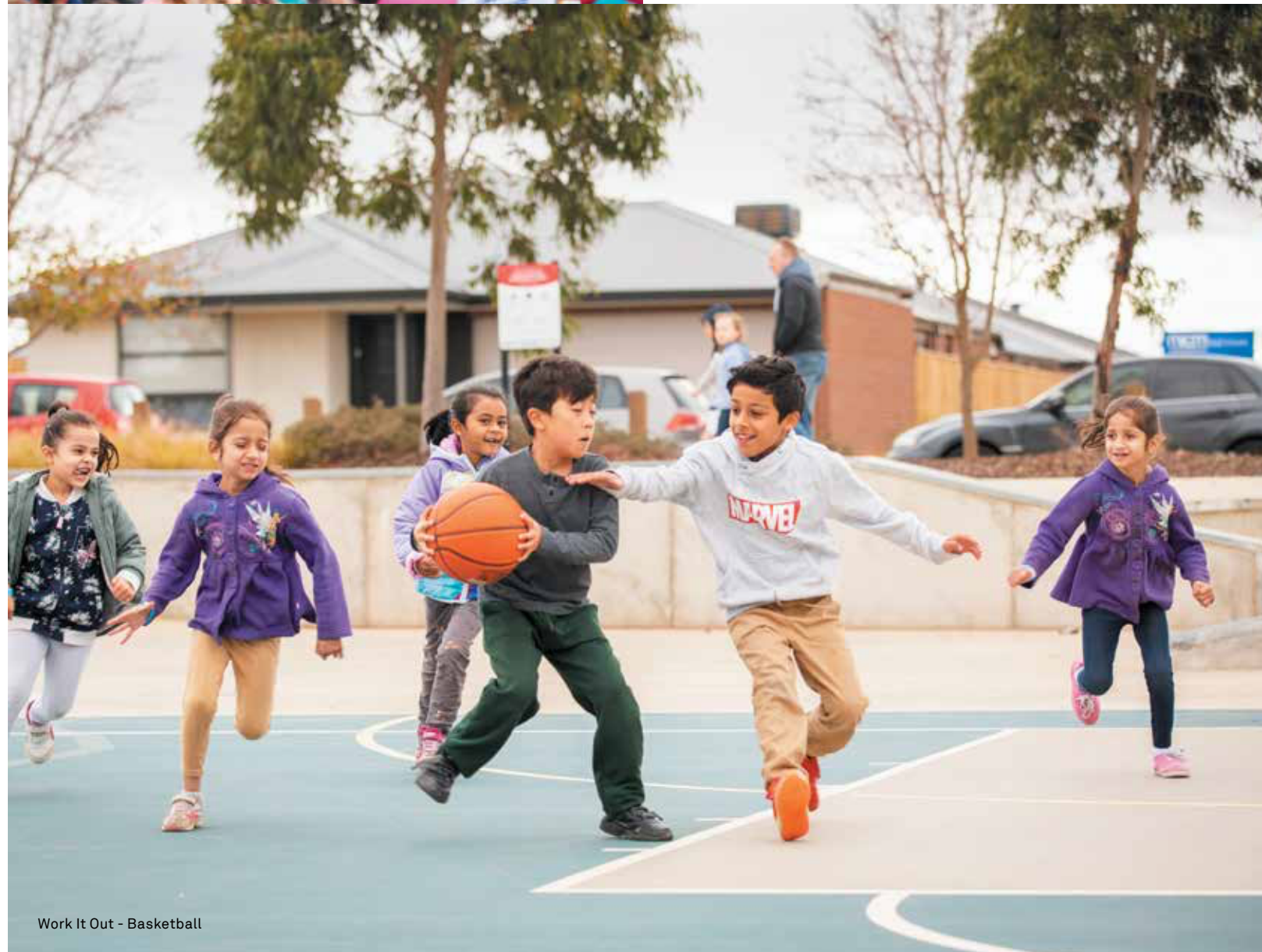
Work It Out - Basketball

A range of activities, initiated by Development Victoria, will delight all ages and build new friendships.