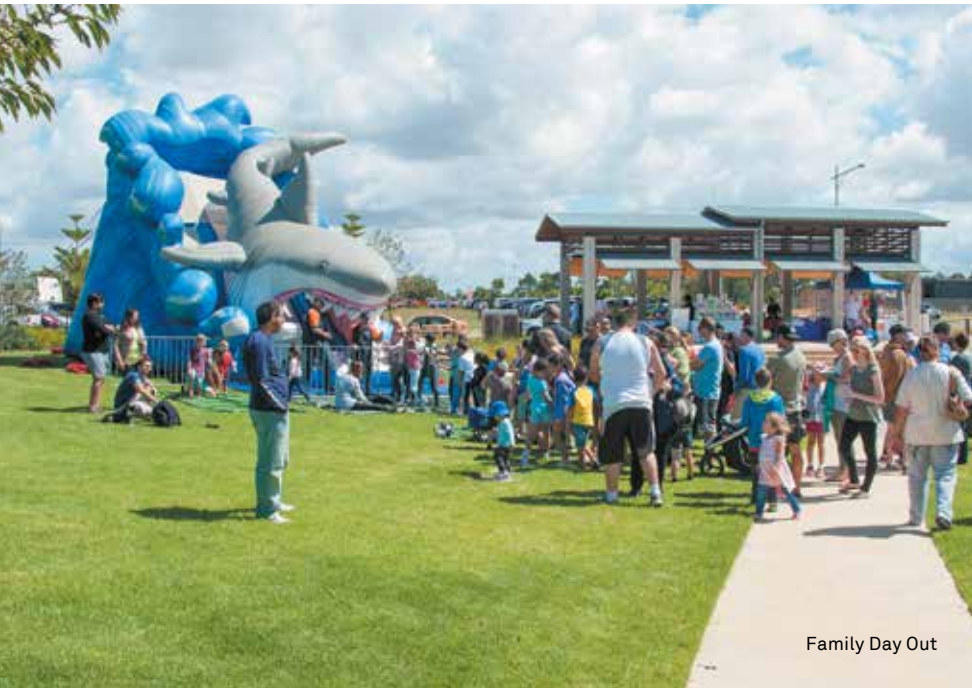
Family Day Out