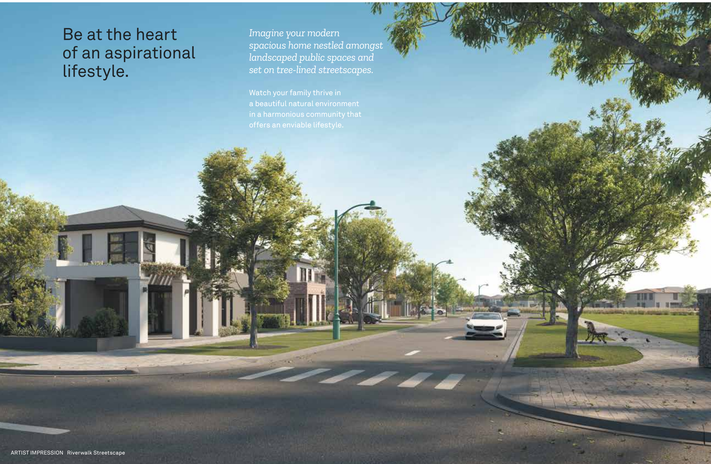
ARTIST IMPRESSION Riverwalk Streetscape

Watch your family thrive in a beautiful natural environment in a harmonious community that offers an enviable lifestyle.