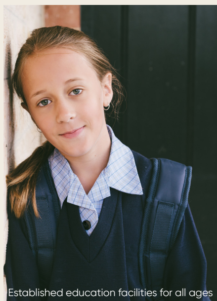
Established education facilities for all ages