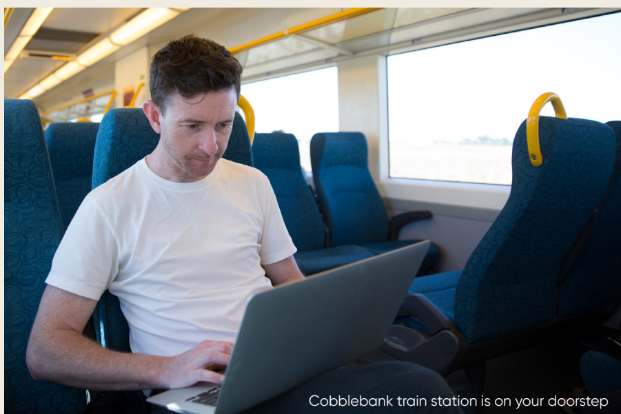
Cobblebank train station is on your doorstep