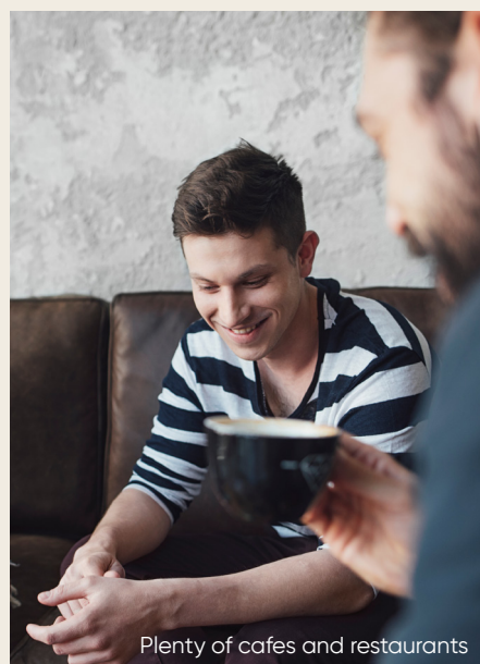
Plenty of cafes and restaurants