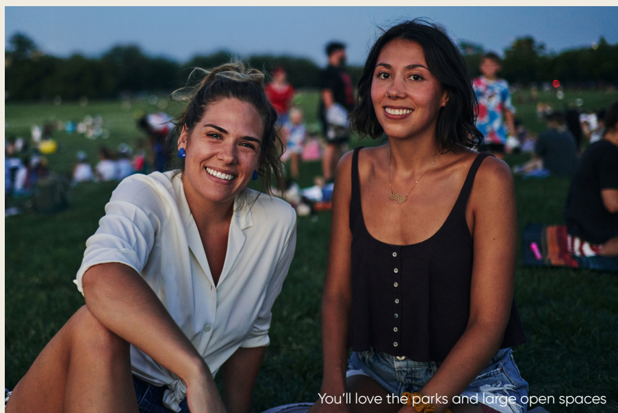
You'll love the parks and large open spaces

Welcome to Willowstone, a vibrant and growing community perfectly positioned near the rapidly developing Cobblebank CBD in Melbourne's dynamic western corridor. Developed by Muncorp, Willowstone offers a close-knit neighborhood with all the essentials for your family right at your doorstep—plus exciting new additions on the way.