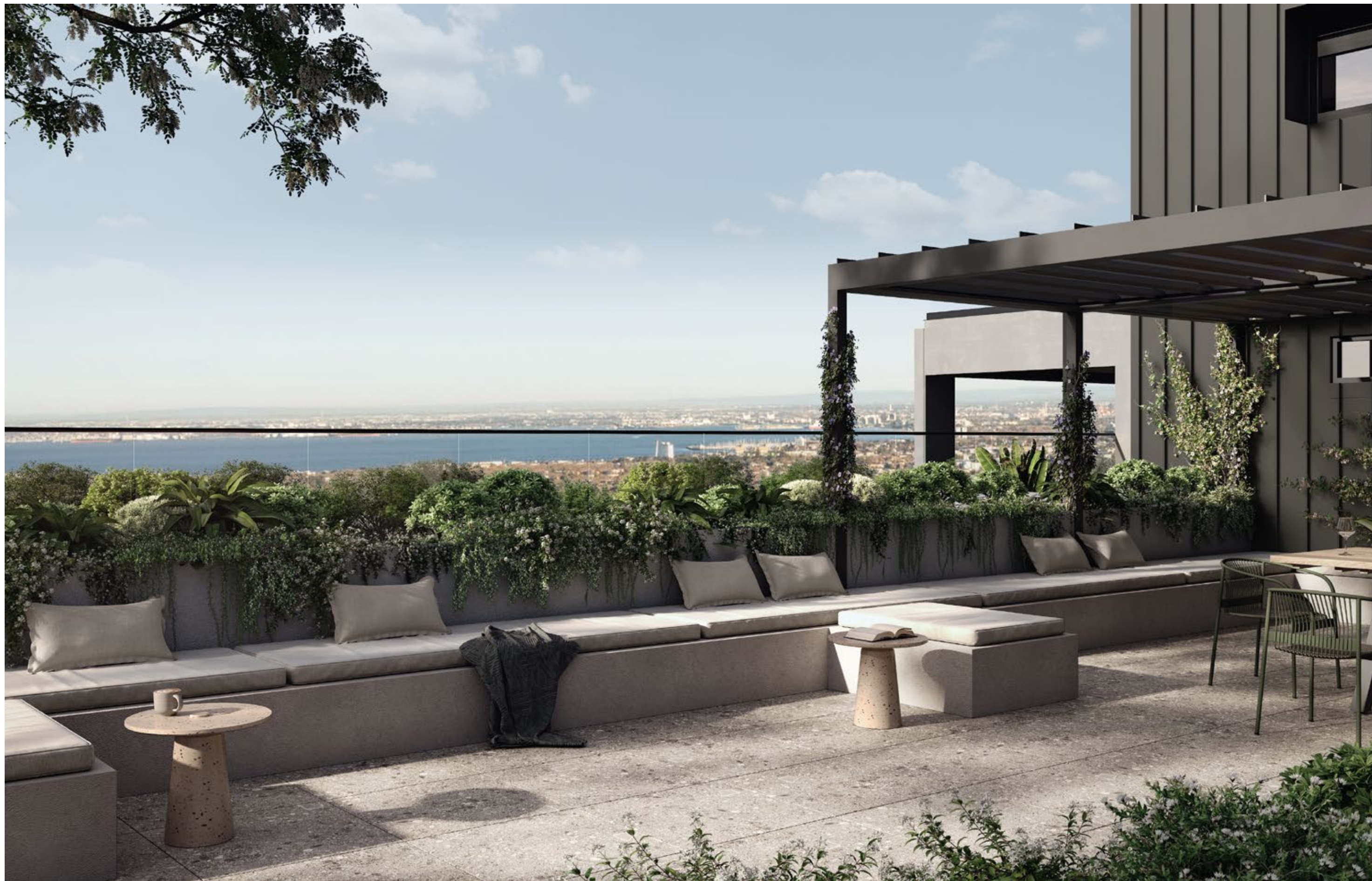
Level 6 residents' terrace.